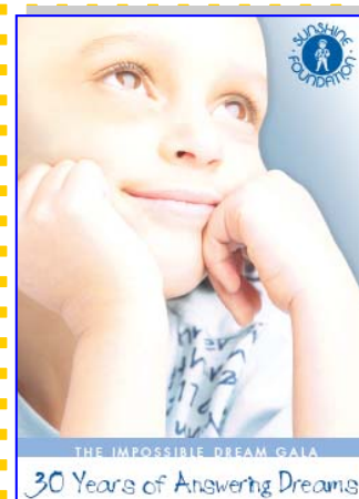
THE IMPOSSIBLE DREAM GALA 30 Years of Answering Dreams

Sunshine Foundation will be celebrating 30 years of making dreams come true for children by hosting "The Impossible Dream Gala." This affair will be held at The Ballroom